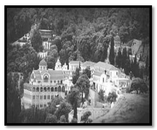
Monastery of the Most Holy Theotokos in Keratea.